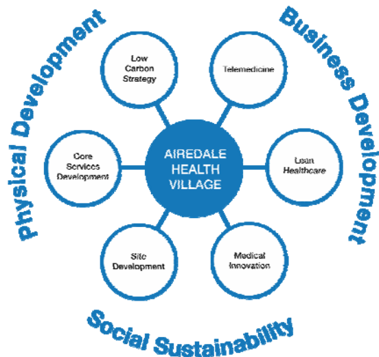
Building a Firm Foundation